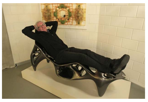
Fig. 6 RP model of furniture