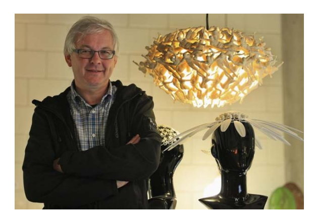
Fig. 7 RP models of an architectural interior design

An RP technique plays an important role in architectural interior design like stature, wall mountings and toys. The RP model of interior decoration has good surface finishing and aesthetics compared with convention models. Fig. 7 shows RP models of an architectural interior design.