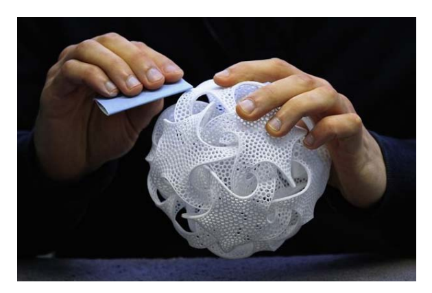
Fig. 8 (a) RP model of special objects (Spherical)

This models having a hollow space in the inner side and thickness in the outer shell. This type of objects has developed in the conventional method is so complicated and time consumptions. But in the RP technique it is developed in the shortest time as compared with the conventional method. Figs. 8 (a) and (b) show the RP model of the special objects developed in the RP techniques.