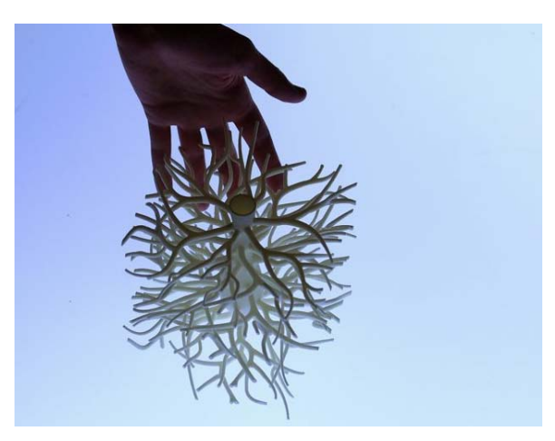
Fig. 8 (b) RP model of special objects (Tree stems)