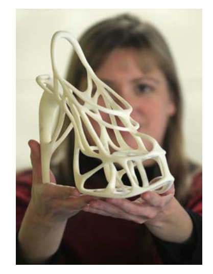
Fig. 5 RP model of foot-ware

The furniture is designed and manufacturing with a aid of RP techniques. This model has low weight and no temporary and permanent joints. It is made up of a single piece without any joints with different profiles. Fig. 6 shows the furniture model developed in the RP technique.