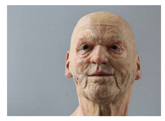
Fig. 2 Damaged facial scull replaced by RP model