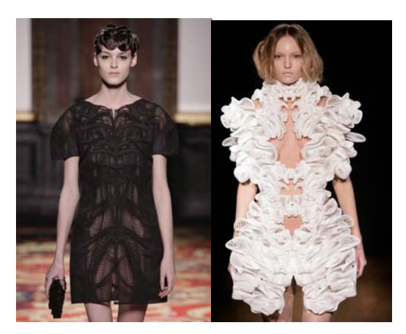
Fig. 3 RP model of dresses with special contours